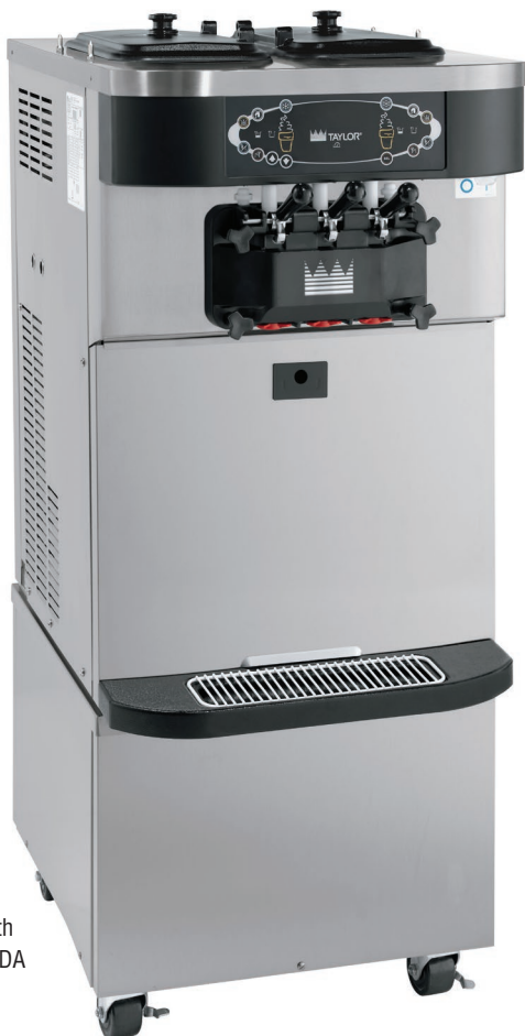
Shown with optional ADA cart.