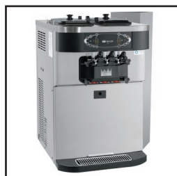
Shown with optional top air discharge chute.