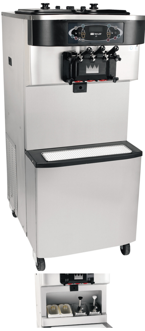
Integrated Syrup Rail Option 2 room temperature with lids & ladles, 2 heated with syrup pumps